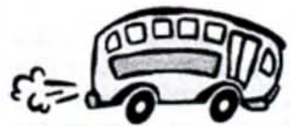
The little chapter that could.....

Join us on May 9th and show what ROBS membership really means. We'll all be there with you.